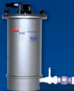
15 Gal. with Gravity Drain 3000101