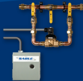
WATER SOLENOID 2900502