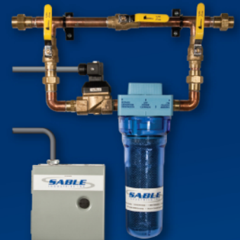
WATER SOLENOID AND FILTER 2900501