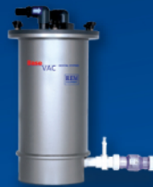
2.5 Gal. "Mini" with Gravity Drain 3000102