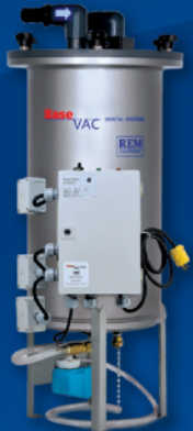
15 Gal. with Auto Pump Drain 3000001